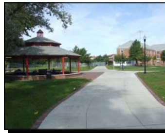
New walkways and lighting are among summer projects.