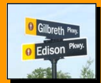
The signage program includes a hierarchy of signage and “wayfinding” strategies.

Visit us on the web at http://www.rowan.edu/facilities to see pictures of the prototypes and provide feedback!