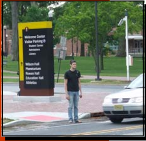
New curbing and signage improve the look of campus

Rowan University is one of several college campuses that is bisected by US Highway 322 (West Chester University and Penn State share this dubious distinction with Rowan).