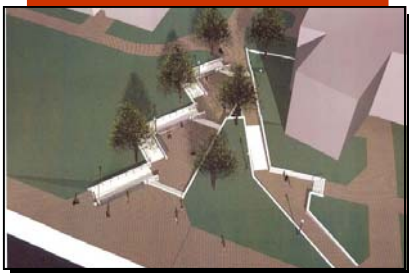
Artist’s rendering of completed plaza and ramps