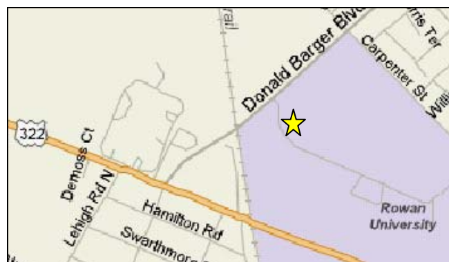
Rowan University (Parking marked with star)