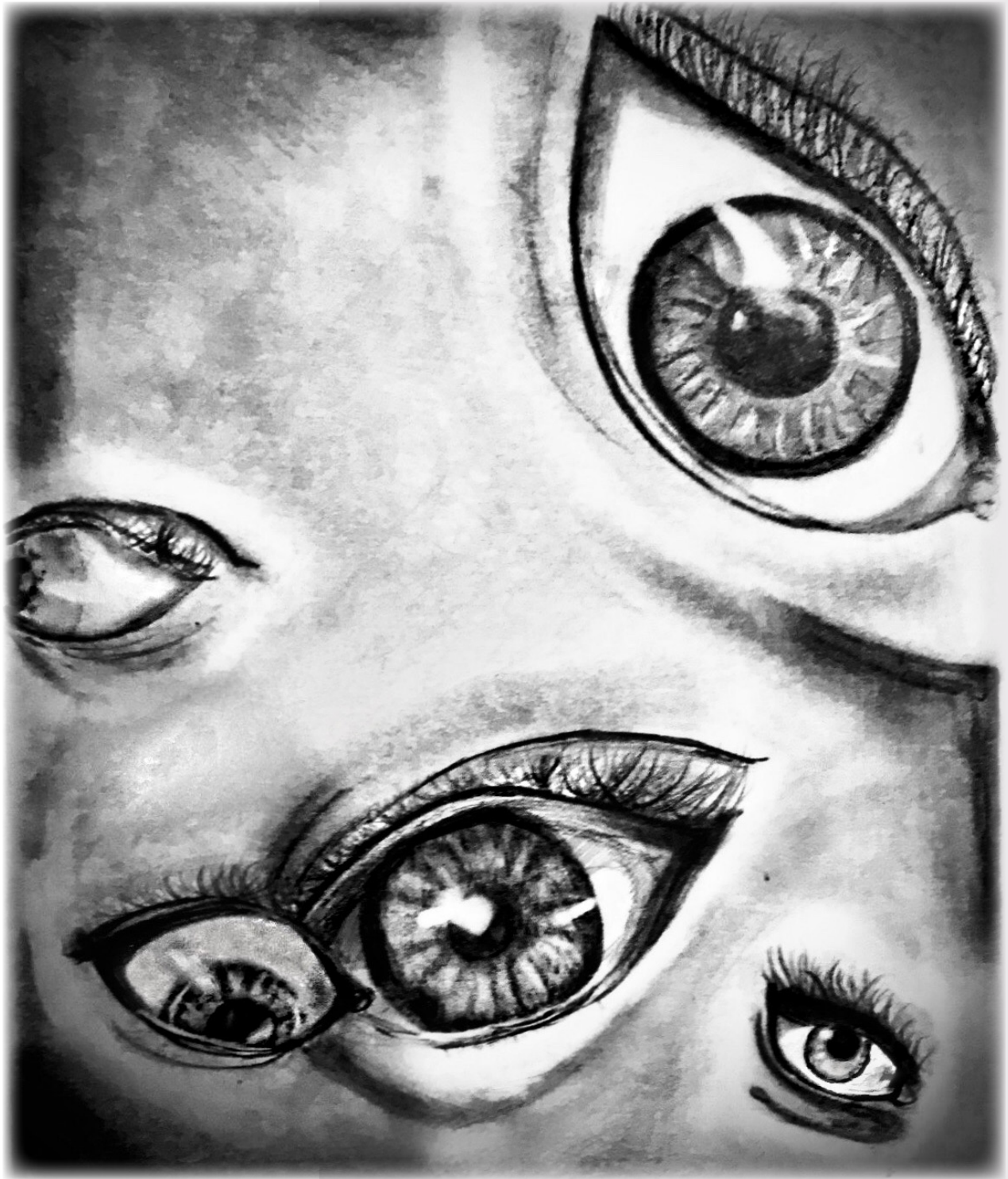
Power of Perspective Pencil on paper Brianna Yates, Class of 2021