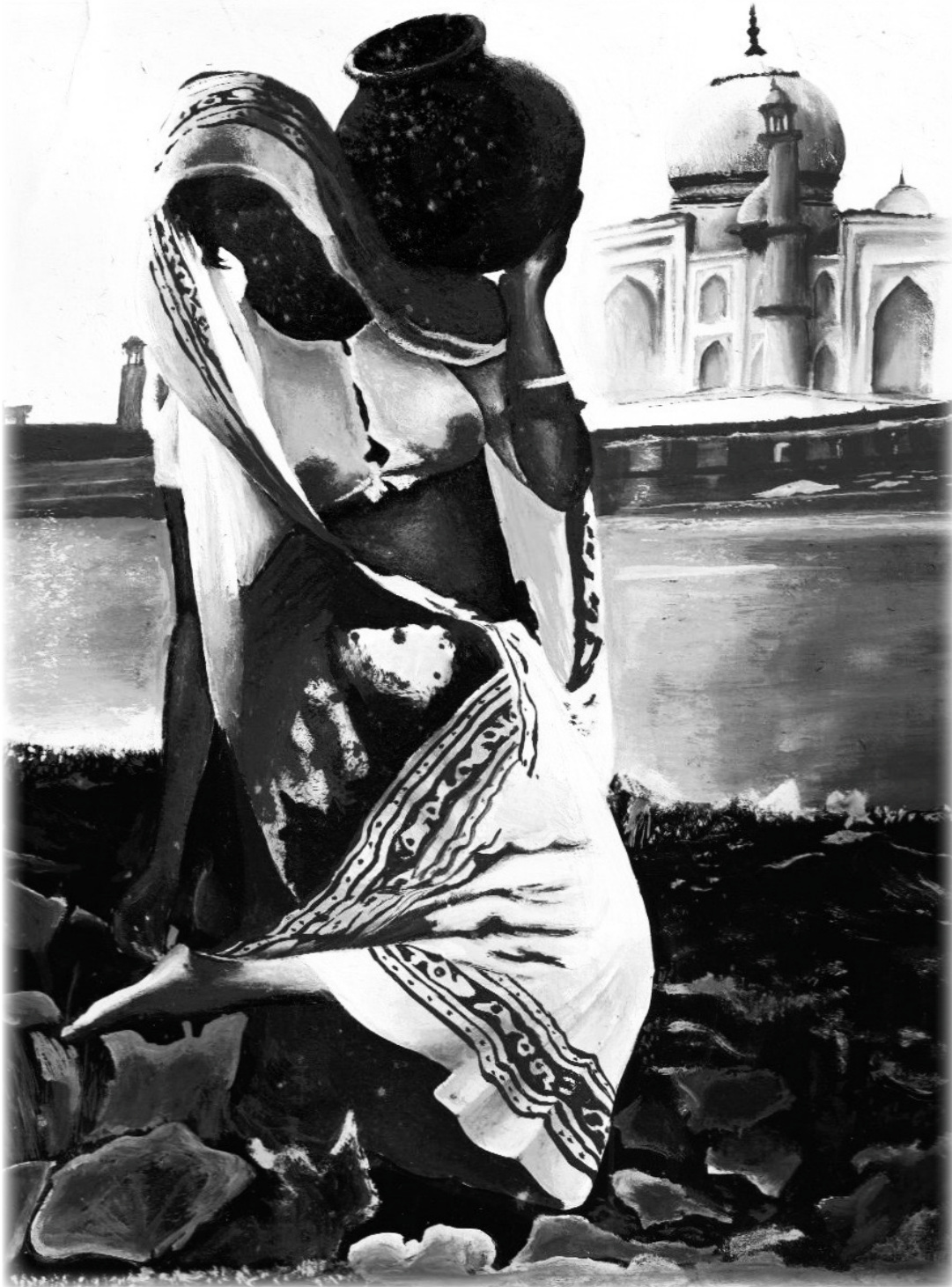
Northern Plight Pencil on paper