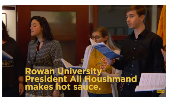
2 Text over video