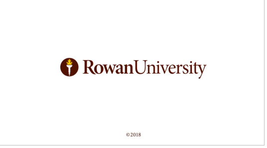
(3) Institutional end card with copyright