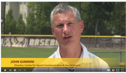
1 Lower thirds

Videos produced by college, school and other communicators should use the unit signature and URL ④. To distinguish non-institutional videos but keep lower thirds consistent throughout the University, download the template at rowan.edu/graphicstandards [under downloads menu] and enter the name and title info for your project.