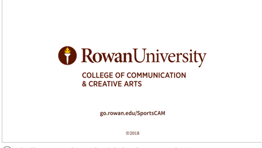
4 College end card with lock-up and URL